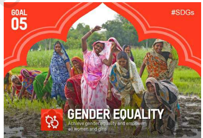
Sustainable Development Goal (SDG) www.in.undp.org

This naturally has an impact on whether girls can attend school. It determines whether women can work outside the house and what kind of jobs and careers they can have. The government has set up anganwadis or child-care centres in several villages in the country. The government has passed laws that make it mandatory for organisations that have more than 30 women employees to provide crèche facilities. The provision of crèches helps many women to take up employment outside the home. It also makes it possible for more girls to attend schools.