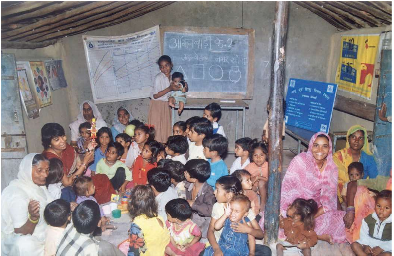
Children at an Anganwadi centre in a village in Madhya Pradesh.

This naturally has an impact on whether girls can attend school. It determines whether women can work outside the house and what kind of jobs and careers they can have. The government has set up anganwadis or child-care centres in several villages in the country. The government has passed laws that make it mandatory for organisations that have more than 30 women employees to provide crèche facilities. The provision of crèches helps many women to take up employment outside the home. It also makes it possible for more girls to attend schools.