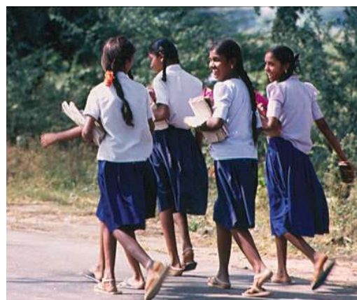
Why do girls like to go to school together in groups?

In what ways do the experiences of Samoan children and teenagers differ from your own experiences of growing up? Is there anything in this experience that you wish was part of your growing up?