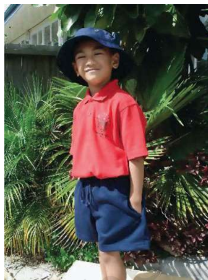
A Class VII Samoan child in his school uniform.

From Class VI onwards, boys and girls went to separate schools. The girls' school was designed very differently from the boys' school. They had a central courtyard where they played in total seclusion and